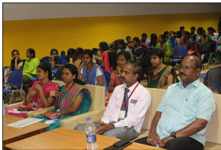
Queries from Panel Members