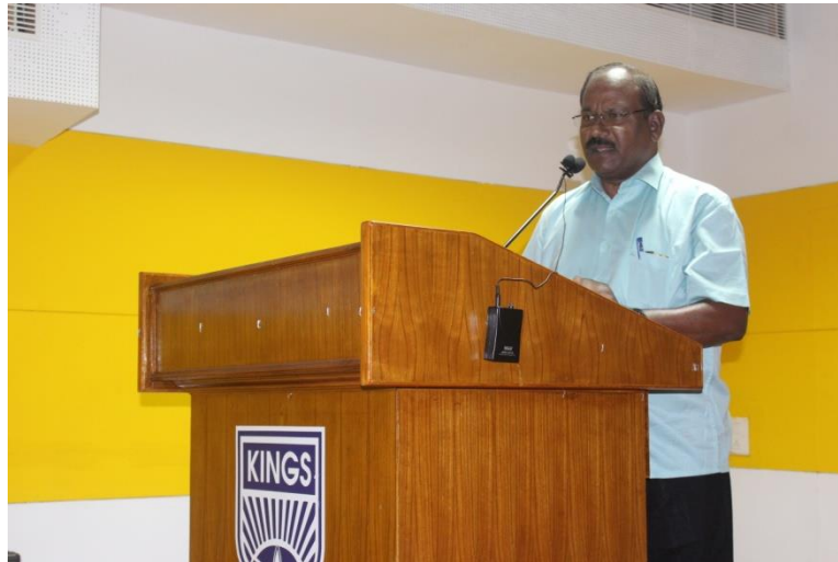
Chief Guest addressing the audience