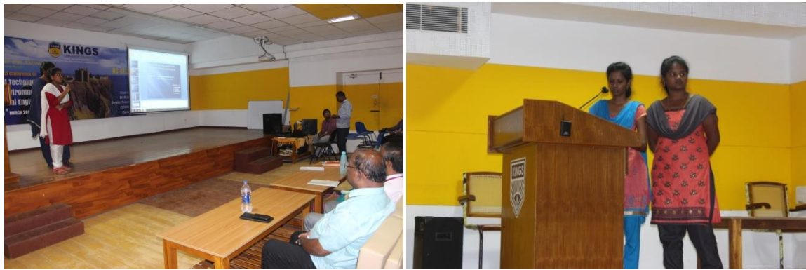
Session- I Student Presentation